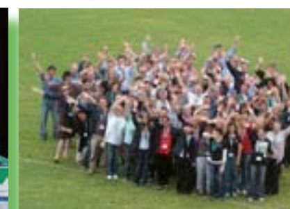
Workplace Reps, Active Members, Branch Executive, Councillors, and ASU staff

As 2008 drew to a close and Governments, industries and communities considered the potential impact of global economic uncertainty and climate change, ASU members considered the environmental, social and economic challenges we face as South Australians.