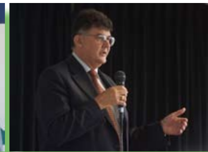
Dr Lynn Arnold